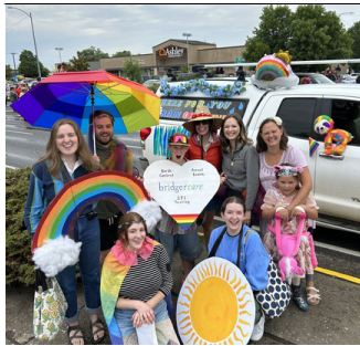
SWEET PEA PARADE