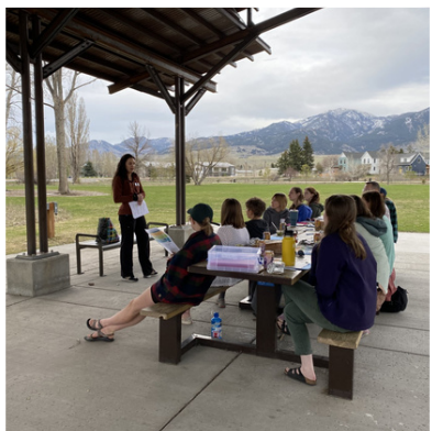
Spring 2023 Session