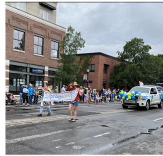
SWEET PEA PARADE FLOAT