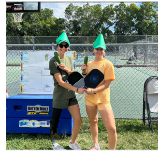
PICKLEBALL COSTUME CONTEST