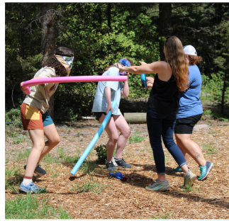
PEER ED RETREAT