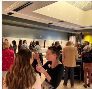
SWEET TOOTH BALL