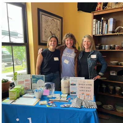
Brand Ambassadors Volunteering