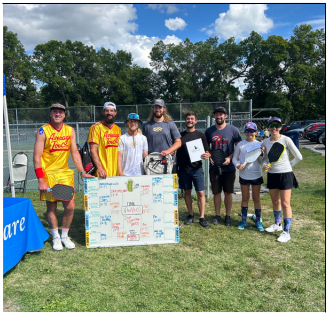
PICKLEBALL BASH WINNERS